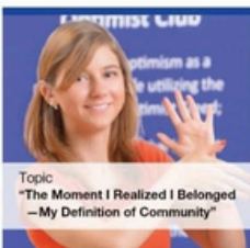
Topic "The Moment I Realized I Belonged —My Definition of Community"