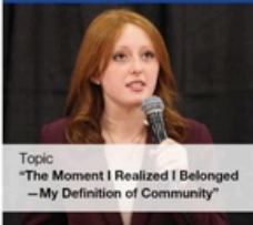
Topic "The Moment I Realized I Belonged —My Definition of Community"